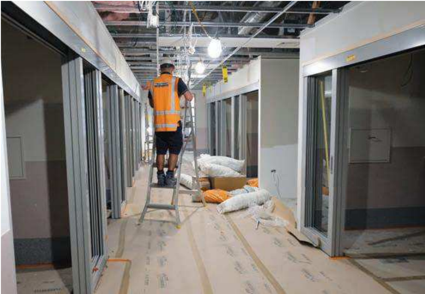
The redevelopment is not affecting the hospital's daily routines with temporary walls in place to keep construction separate.

"We've had an excellent relationship with Higgs Construction over many years and we've been really satisfied with how they have managed and organised the works programme."