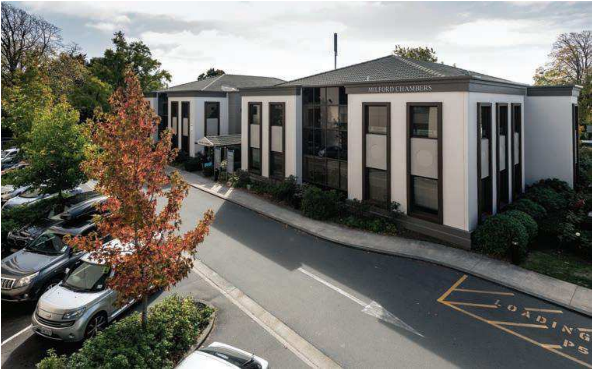
The long running project undertaken by Higgs Construction has been progressively transforming the hospital campus in Merivale since 2014.