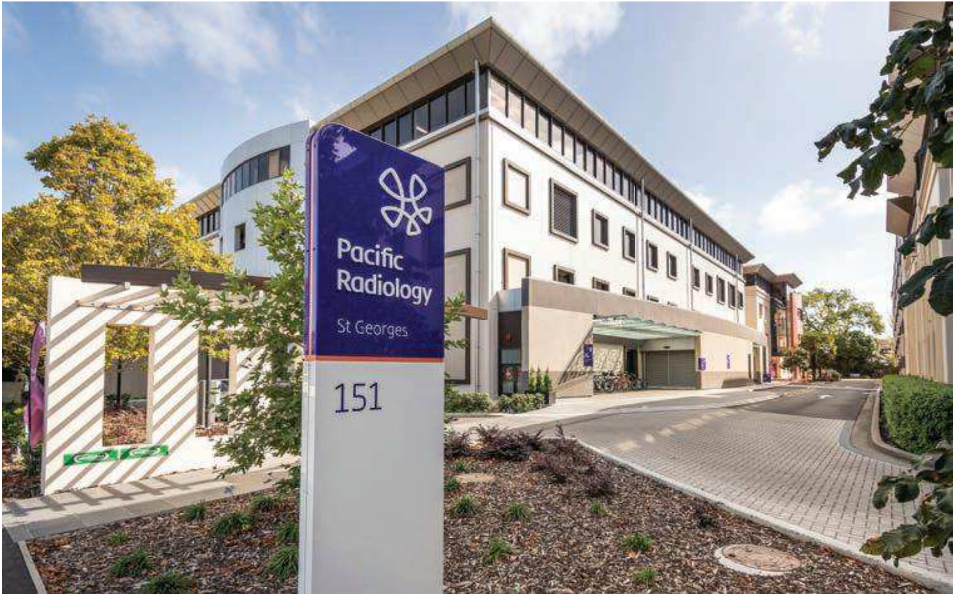
The third and final phase of the St George's $120 million redevelopment is again making good progress after COVID-19 restrictions.